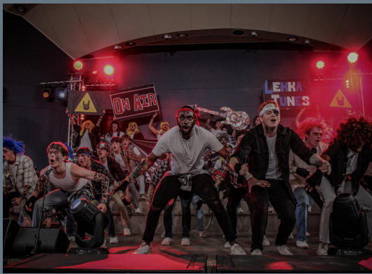
"since you've been gone"