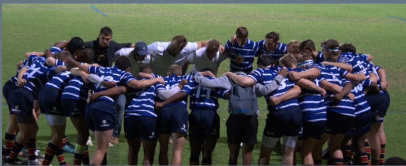
u20's getting ready for a game

The Rugby boys certainly gave us a show from the sidelines. From our Chairperson hobbling around with an injury to the U20s clinching wins against Morula and Sonop, the matches were anything but friendly—and honestly, that's just how we like it. We were one kick away from tying with Mopane, ending with a tense 5-7 score. The first team had us sprinting up and down the field, showing true resilience. But let's be honest, the OutSurance referees were really the ones testing our patience.