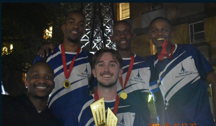
football gents after securing the Deans tournament

Furthermore, the tennis, hockey, basketball, netball, squash and frisbee teams also achieved significant victories, showing their exceptional skills and teamwork.