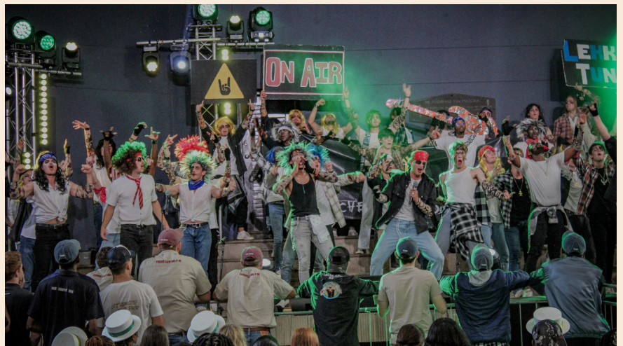
TAU on the Amphitheatre stage